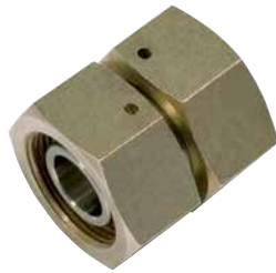
DKS (L, S)