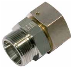
GDA [Pos. 1]